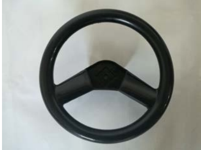
1. One steering wheel