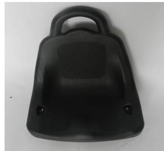
2. One seat