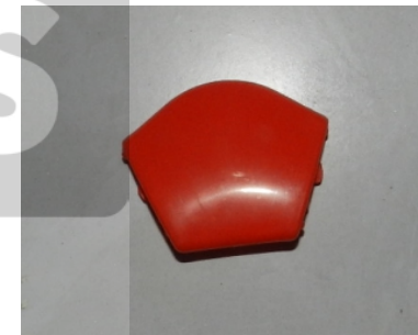
9. Steering Wheel Cover