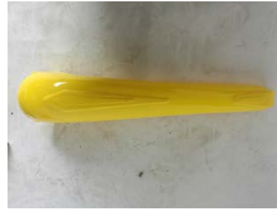
6. One front panel