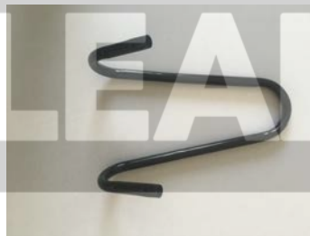
4. One steering support