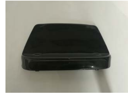
7. One license plate