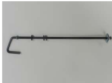
3. One steering shaft