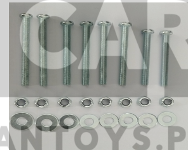
8. Bag of nuts and bolts 2 x M5*40mm bolts, 4 x M5*45mm bolts, 2x M5*50mm bolts 2x 5*14washers 6x 5*12washers 8 pcsxM5nuts