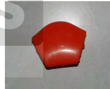
9. Steering Wheel Cover

8. Bag of nuts and bolts (4 x M5*40mm bolts, 4 x M5*45mm bolts, 2 x M5*50mm bolts 4x 5*14washers 6x 5*12washers 10pcsxM5nuts The extra for standby use: 1pc 5*14washer 1pc 5*12washer 1pc nut