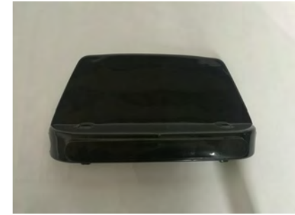
7. One license plate