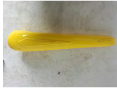
6. One front panel