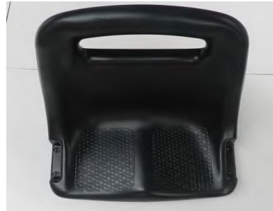
2. One seat