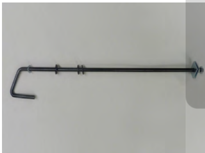
3. One steering shaft