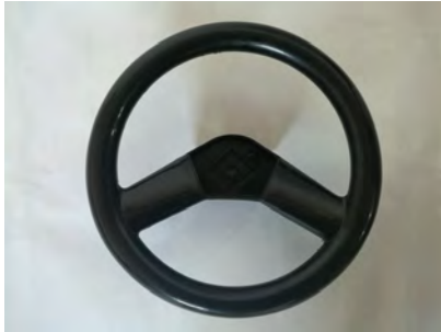
1. One steering wheel