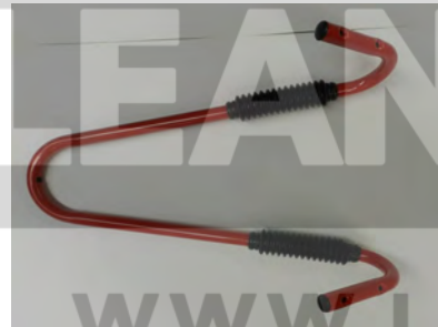
4. One steering support