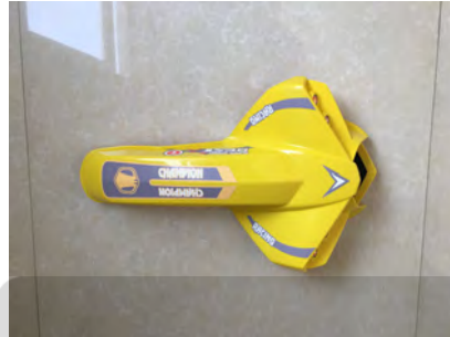
2.one front panel