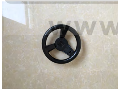
4.one steering wheel

7.Place the steering wheel cover in the center of the steering wheel.