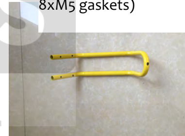
8. One steering support